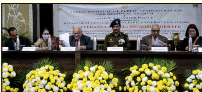
Participants during the programme