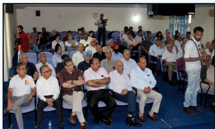
View of Audience during the Workshop

During his lecture, Justice Shukla discussed freedom of expression and free press. He stated that free press