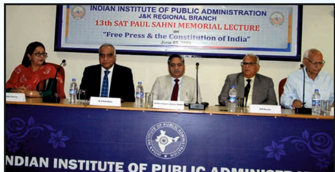
Participants during the lecture

The Indian Institute of Public Administration (J&K Regional Branch) held its 13th Sat Paul Sahni Memorial Lecture on “Free Press and the Constitution of India” on June 3, 2023.