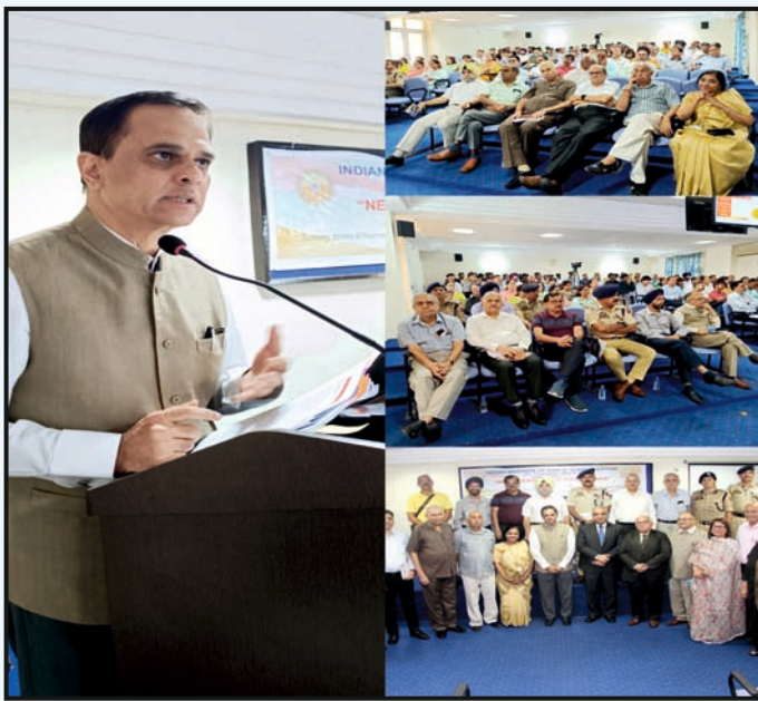
View of Audience

role in evaluating and enhancing the performance of districts across the nation. This initiative facilitates healthy competition among districts, encouraging them to strive for higher standards of governance and service delivery. National E-Services Delivery Assessment is another significant step towards evaluating and benchmarking e-services delivery mechanisms, promoting innovation, and ensuring the effective redressal of public grievances. It stands as a testament to the government's commitment to providing citizen-centric services in the digital age. He said that efficiency in the Central Secretariat is being enhanced through systematic reforms and leveraging technology to streamline processes, improve coordination, and achieve greater effectiveness in policy formulation and implementation through convergence of multiple portals to one portal "one nation, one portal" with reverse integration. Jammu & Kashmir is a huge success story in this context. Vision India@2047, an ambitious initiative, aims to transform India into a self-reliant and globally competitive nation, emphasizing sustainable growth, equitable development, and inclusive governance is a testament to the government's unwavering commitment to providing efficient, transparent, and citizen-centric services. These transformative initiatives pave the way for a brighter and more prosperous future, aligning with the aspirations of a 'New India' by 2047.