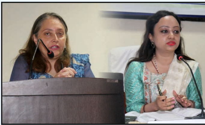
View of Audience during the Workshop