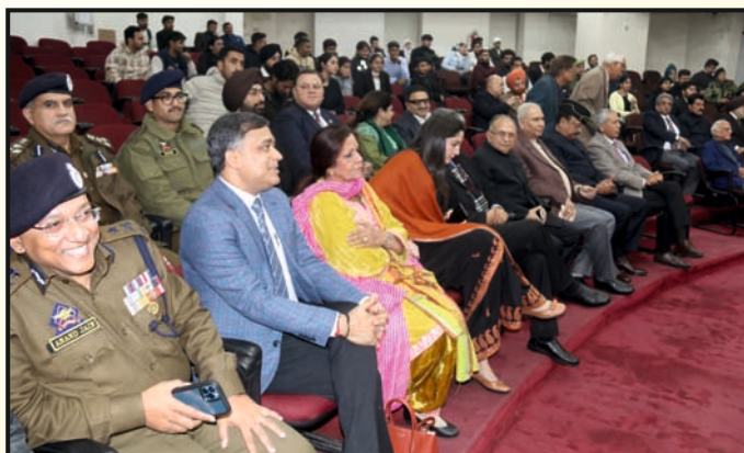
Participants during the conference