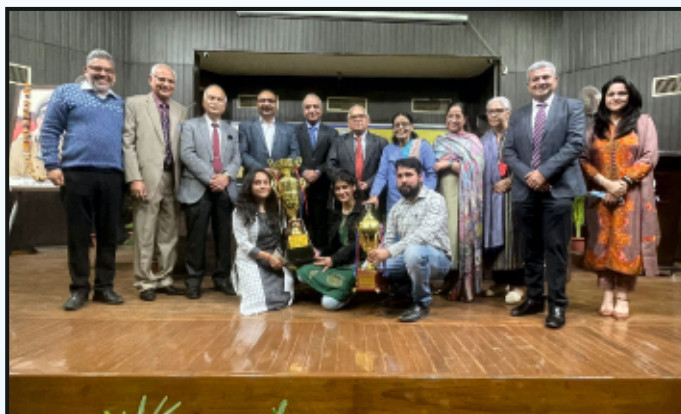
Winning team receiving Veeranna Aivalli trophy

Indian Institute of Public Administration, J&K Regional Branch and J&K Police in collaboration with Department of Students Welfare, University of Jammu organized the 20th Annual Veeranna Aivalli Memorial Debate Competition on the topic "In the opinion of the house, it is the culture of sports and not just Government Policy that can improve Indian medal tally at Olympics 2024" on March 11, 2022. A total of 29 teams from various institutions of the region participated in the competition.