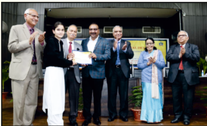
Dignitaries presenting the certificate to the participants