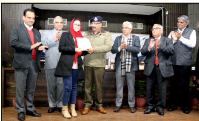
Dignitaries presenting the certificate to the participants