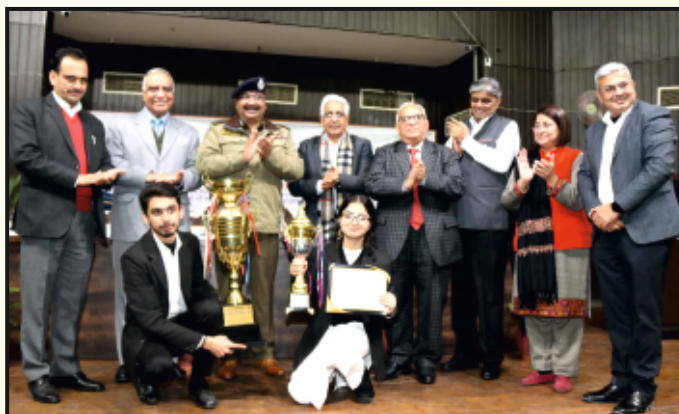
Winning team receiving Veeranna Aivalli trophy

Indian Institute of Public Administration, J&K Regional Branch and J&K Police in collaboration with Department of Students Welfare, University of Jammu organized the 21st Annual Veeranna Aivalli Memorial Debate Competition on the topic "In the opinion of the house, pre-poll freebies is a misuse of taxpayers money and hampers the financial sustainability" on December 15, 2022. A total of 34 teams from various affiliated colleges and University teaching departments and other Universities and Institutions of the region participated in the competition.