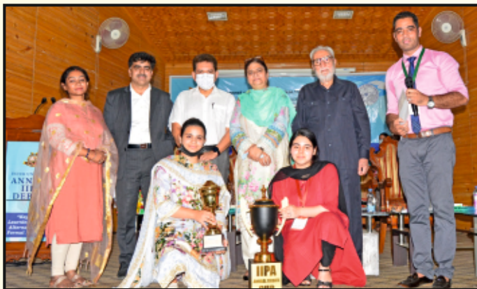
Winning team receiving trophy

Indian Institute of Public Administration (IIPA) J&K Regional Branch Kashmir organized Annual IIPA Debate in association with Department of Students Welfare University of Kashmir on August 18, 2022.