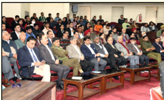
View of Audience during Debate Competition