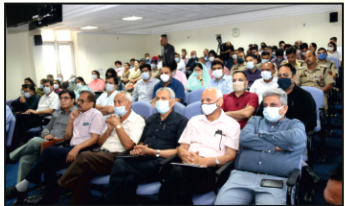
View of Audience during the Workshop