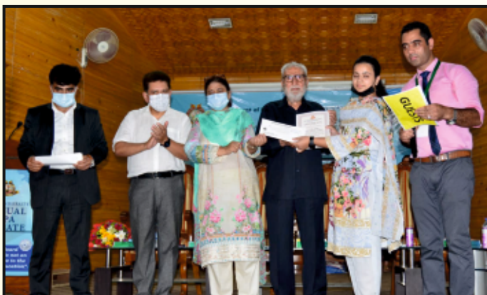
Dignitaries presenting the certificate to the participants