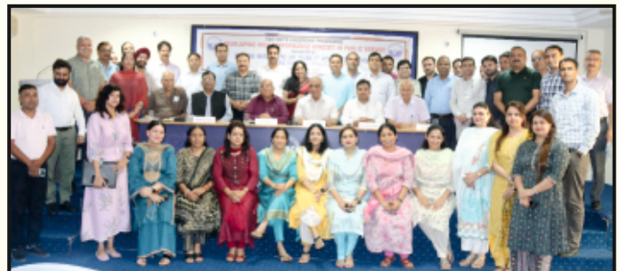
Participants during the programme