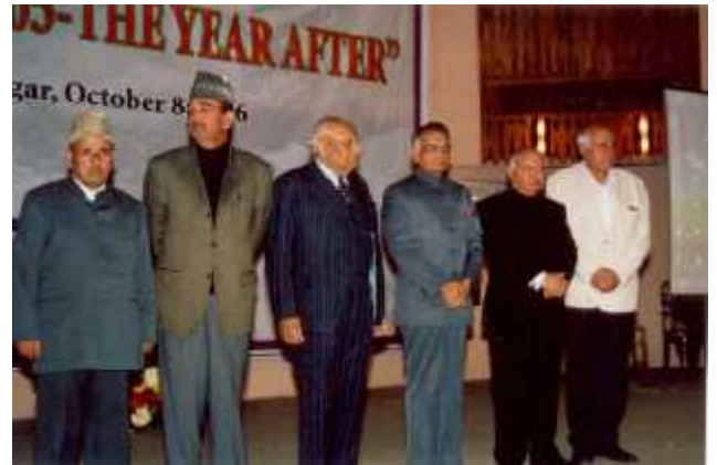
Lt. Gen. S.K Sinha, Union Home Minister sh. Shiv Raj Patil, Chief Minister Jb. Ghulam Nabi Azad , Dr Farooq Abdullah and other dignitaries during an IIPA function on Oct, 08, 2006