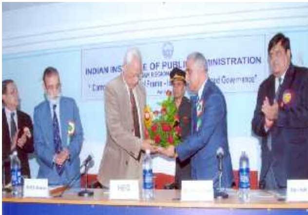
Dr. Ashok Bhan welcoming Hon'ble Governor , Sh. N.N Vohra during a seminar on Corrosion of Steel Frame : Implication on Good governance on April 9, 2011