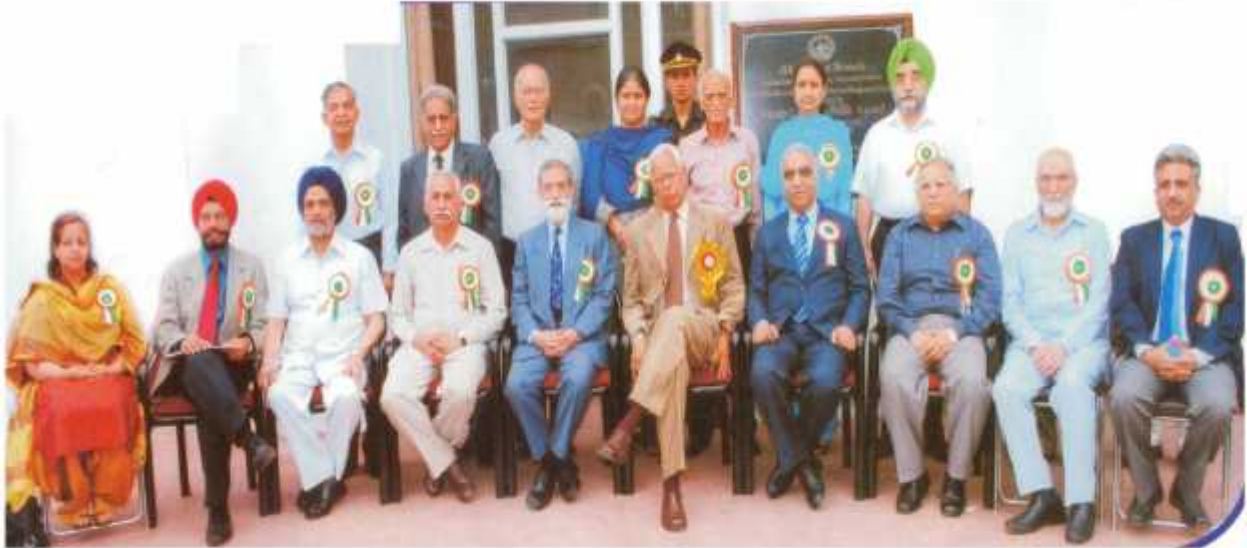
GROUP PHOTOGRAPH OF MEMBERS OF EXECUTIVE COMMITTEE WITH SH. OMAR ABDULLAH, HON'BLE CHIEF MINISTER, JAMMU AND KASHMIR STATE (March 16, 2012)