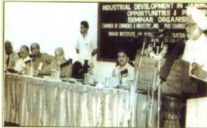
Dr. Manmohan Singh, Union Finance Minister speaking during a seminar in Jammu on April 21-22, 1995