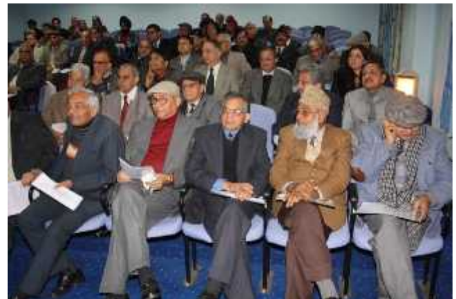
View of IIPA Members on 33 rd AGM held on Jan, 7, 2012 consumer welfare on April 5, 2013