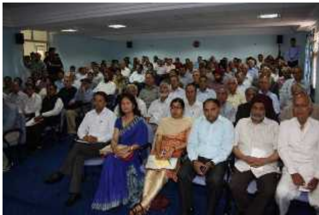
View of Participants on workshop on consumer protection and consumer welfare on April 5, 2013