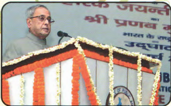
Hon'ble President of India speaking at Diamond Jubilee Celebrations

Speaking on the occasion, the President said that democracy is the soul and the core of our nation-building. No meaningful growth or governance can be achieved without the preservation and nurturing of this basic grid of our polity. All the three structures of governance, the Legislature, Executive and Judiciary would need to continue striving to strengthen the democratic foundation. The President said that for inclusive growth and development, the importance of the quality and efficient delivery of public services cannot be exaggerated. The increasing expectation of the people can only be met by improving good governance practices for on it hinges the welfare of the people.