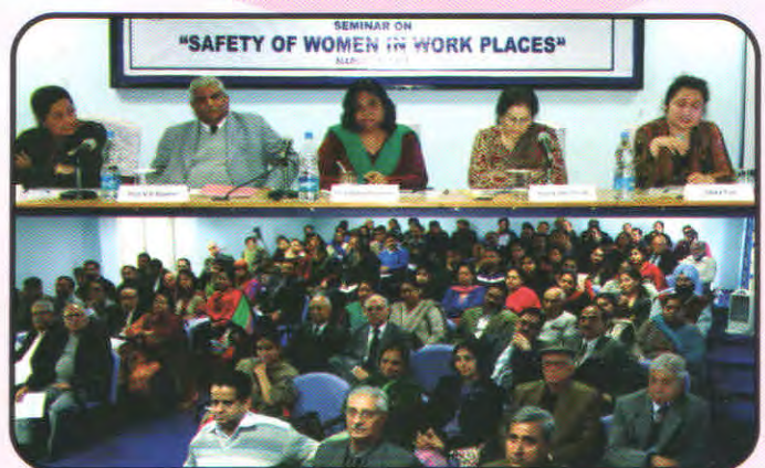
Panelist & Delegates from various organisations