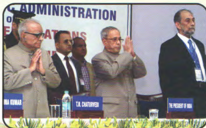
Hon'ble President of India & other dignitaries at the function

The President said that though the term, Good Governance, appeared more frequently in the development lexicon only about two decades back, its importance was recognized since ancient times. As emphasized by Kautiliya in his "Arthashastra", "The happiness of the people is the happiness of the king; Their good alone is his, his personal good is not his true good; the only true good being that of his people: Therefore let the King be active in working for the prosperity and welfare of his people". Mahatma Gandhi's concept of Purna Swaraj or the idea of strong and prosperous India is based on the foundation of Good Governance. The importance of Good Governance is being increasingly accepted and recognized because of its inseparable link to social welfare and public good. Good governance permeates virtually all aspects of human life. It encompasses rule of law,