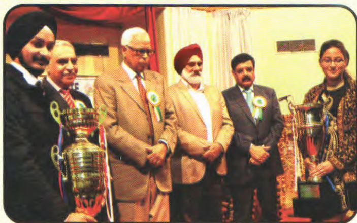
Hon'ble Governor presenting the trophies to the winning team Govt. College of Engineering & Tech, Jammu