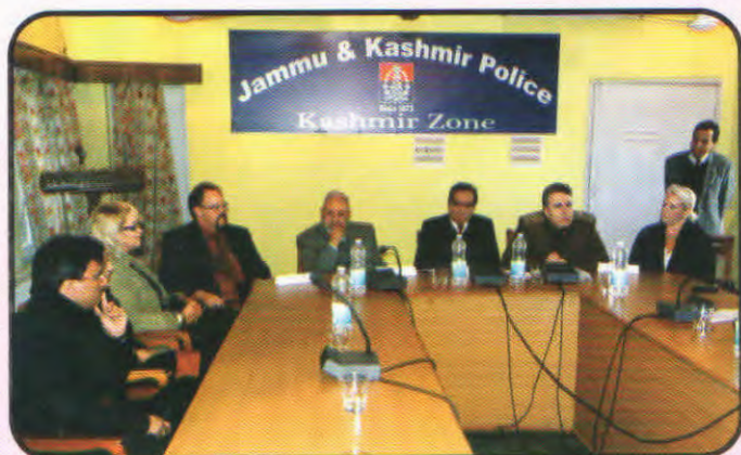
International Experts & J&K Police Delegates during the interaction